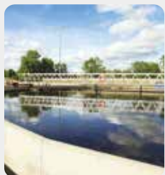
Industrial Water Treatment