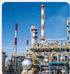
Petroleum & Gas