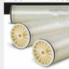
Dupont Filmtech RO, UF and NF Membranes