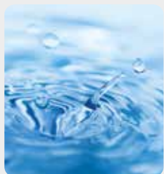
Renewable & Potable Water