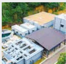
Water and Wastewater Purification