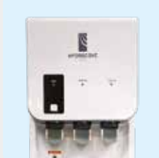
Hydrocove Water Purifiers