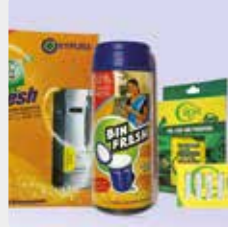
Value Added Activated Carbon Products