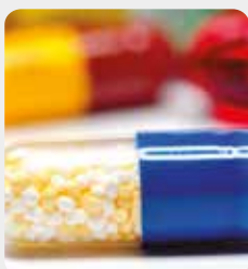
Medical & Pharmaceutical