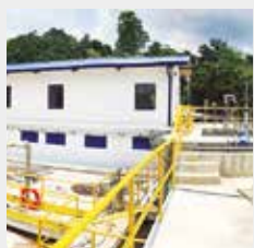
Operation and Maintenance Service