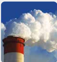
Industrial Air & Gas Treatment